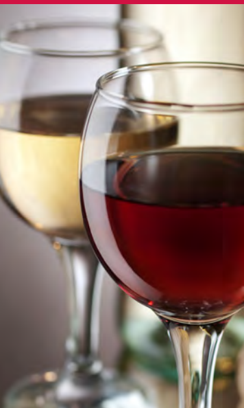
Table Wines. All prices are per bottle.